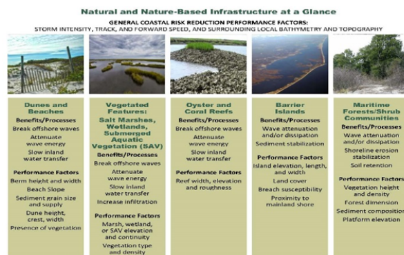
Figure 1. Natural and Nature-Based Features

To more clearly articulate the universe of measures and how USACE would use them to manage coastal storm risk, the USACE published “Coastal Risk Reduction and Resilience: Using the Full Array of Measures” [7]. This report introduced the term “Natural and Nature-Based Features” (NNBF) to refer to the universe of natural features, created and evolving over time through the actions of physical, biological, geologic, and chemical processes operating in nature (Figure 1). Nature-based features are those that may mimic characteristics of natural features but are created by human design, engineering, and construction to provide specific services such as coastal risk reduction. Scientific research to better understand the role of natural landscapes nature-based features and natural processes in the context of coastal and fluvial flood risk has and continues to be undertaken internationally [8-11]. The USACE paper advocated an integrated approach to risk reduction through the incorporation of natural and nature-based features in addition to nonstructural and structural measures that also improve social, economic, and ecosystem resilience.