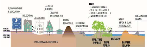
Figure 3. The Full Array of Coastal Storm Risk Management Measures