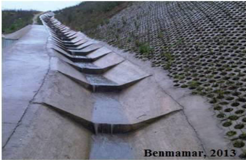
Photo 2. Gutters stairs

The level of protection of the facilities would decrease: a return period of 50 instead of 100, 10 instead of 20 years and 5 instead of 10 years.