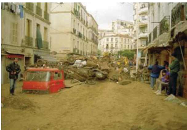
Photo 1. Flood of Bab El Oued 2001

Algeria is one of the southern Mediterranean countries which suffered from devastating floods. While in the past these floods were especially due to overflows of major rivers in large agricultural plains (Chellif, Soummam, Sebaou ...), since thirty years they have mainly affected major cities and urban centers ; they have caused many casualties and considerable material damages (Bab El Oued floods in 2001 and 2013; Ghardaia, 2008; Annaba in September 2009 and February 2015, El Taraf, 2012, Algiers, 2015 ...) [2, 6].