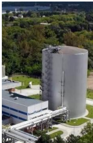
Fig. 9. TES in Ostroleka Power plant.