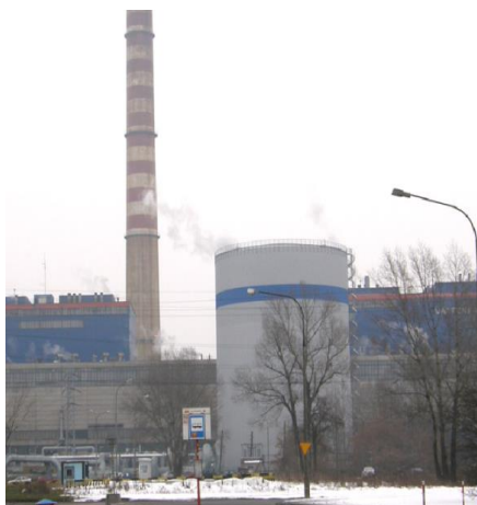
Fig. 2. TES in Siekierki CHP plant.