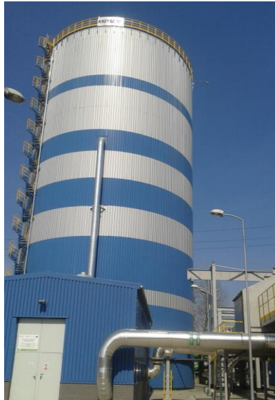
Fig. 7. TES in Bialystok CHP plant.