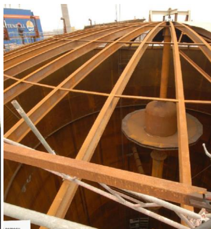
Fig. 3. Upper orifice in the tank of TES.

Due to application of the TES in Siekierki CHP plant, only in 2009 year i.e. in the first year of the TES operation, overall efficiency of energy generation (heat and electricity) by the plant has increased from 86.6% to 87.3% [6]. Also, temporary run of peak water boilers was reduced by nearly 70%, production in cogeneration mode in the CHP plant was increased significantly and reduction of pollutant emissions i.e. dust, SO 2 , NO x to the atmosphere was observed [6].