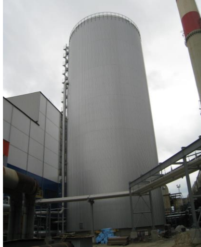
Fig. 6. TES in Cracow CHP plant.