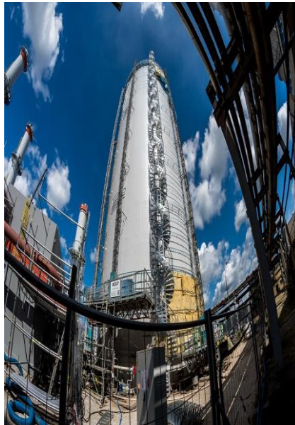
Fig. 10. TES in Torun CHP plant.