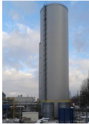
Fig. 8. TES in Bielsko Biala CHP plant.