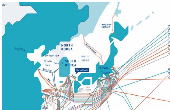
Fig.4. Undersea communications cables around Japan source : TeleGeography Submarine Cable Map 2016.

communications cables (Article 4). Therefore, it is worth considering that EBA would include similar provisions.