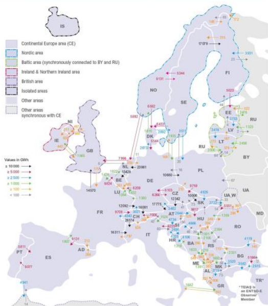
Fig. 2. Power flows between countries in Europe (2015)

The region is divided into four synchronous grids, Continental Europe, Nordic, UK, and Baltic, and they are connected asynchronously through direct current transmission, so that electricity trade can be conducted among them.