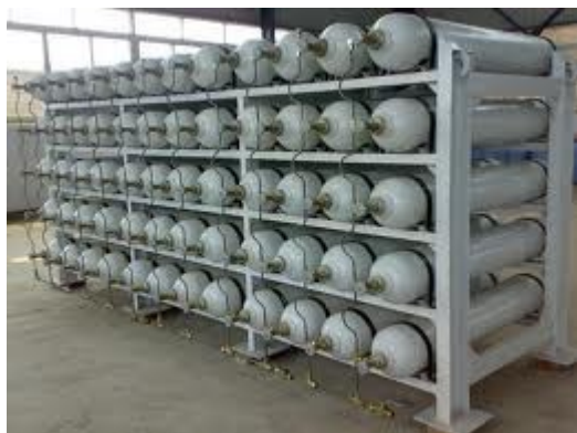
Fig. 4. pressure of 200 bar CNG Tubes

Calorific value is the amount of heat generated by the combustion of materials or fuels. Measured in units of energy per amount of material, for example kJ / kg. Calorific value of the fuel is divided into two kinds, namely: a calorific value above (HHV) and lower calorific value (LHV).