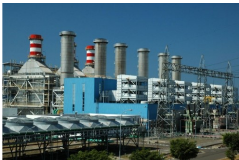
Fig. 1. Grati Power Plant in East Java (Pasuruan)

Grati Power Plant in East Java (Pasuruan) consists of: Gas Turbine: 112.450 MW x 3; Steam turbine: 189.500 MW; Block output 526.850 MW.