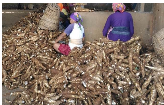
Fig. 3. Workers was doing cutting rods cassava.