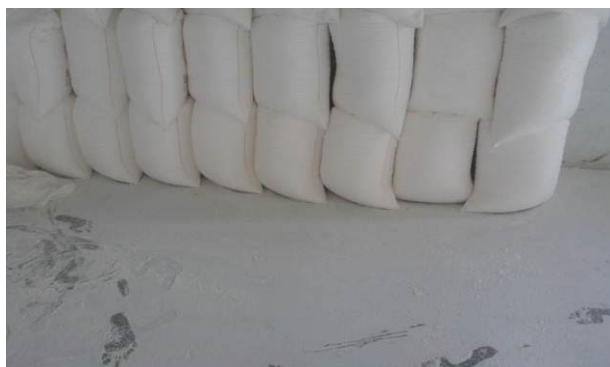
Fig. 4. Floor condition of milling and packaging room.

At milling and packaging process, spills of tapioca starch happened because of size of starch is small so easy to down. In addition, spills of tapioca starch also happens when packing process that still running manually with put the first starch on the flour before moved to sack. Good housekeeping opportunities can be applied is recollecting spills of tapioca starch using broom. Actually, broom starch has been provided, but it was rarely used by workers to collect the spills. By giving knowledge and counseling to workers that the spills of tapioca starch has actually product that can be sold but they have wasted is expected to reduce amount of spills and increase quantity of final product.