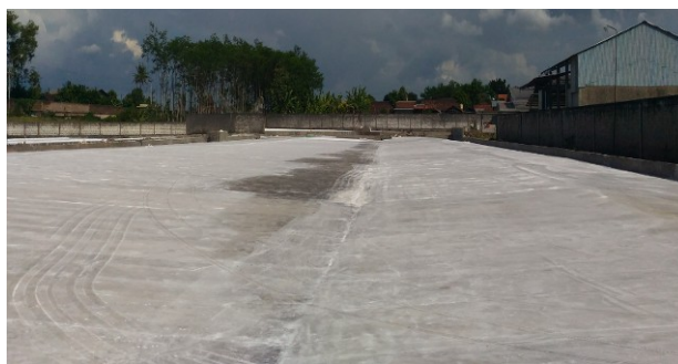
Fig. 4. Condition of the floor after drying process.

After drying process finished and tapioca starch moved to milling and packaging room, there were still founded tapioca starch left on the drying floor. This thing happened because of lack of employee's awareness about production efficiency and waste prevention. Tapioca starch that left behind should be can still continue to next process and increasing the number of final product. Good housekeeping alternative that can be suggested is to increasing employee's knowledge so can raise awareness to not leaving material that can still continue to next process.