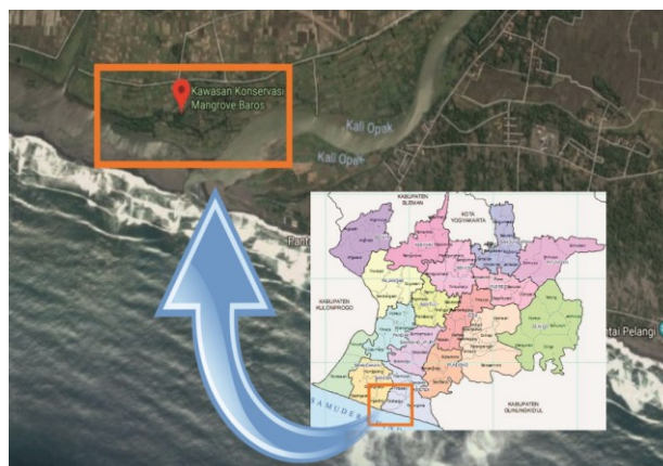
Fig. 1. Map of Mangrove Baros Forest Area

This research was conducted in Baros mangrove forest area, Tirtohargo village, Kretek subdistrict, Bantul district located at 110 ° 17 '9199 "BT and 8 ° 0' 48.066" LS. The location of this study was chosen because it is the only mangrove forest in Bantul district and is one of the icons of tourism and conservation. The location of the research can be seen in Figure 1.