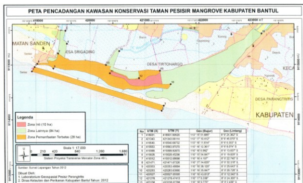
Fig. 3. Map of reserve area of conservation of mangrove coastal park Bantul Regency