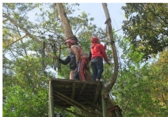
Fig. 4. Supporting Facility and Flying Fox (Doc. 2015)