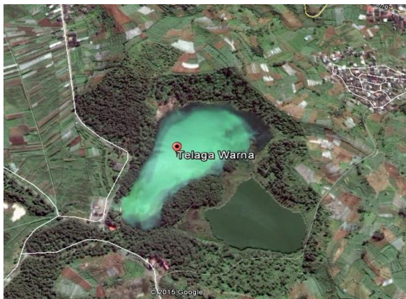
Fig. 2. Telaga Warna and Telaga Pengilon from Satellite Imagery (Google earth, 6th Dec. 2015)

The Telaga Warna when viewed closely shows the calm and cool atmosphere provided by Telaga Warna and Telaga Pengilon due to the charm of its own natural beauty.