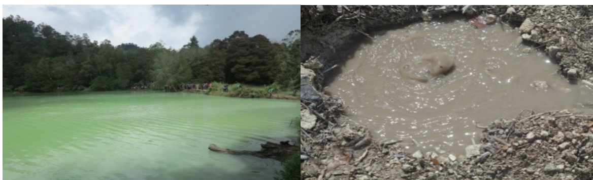
Fig. 3. Yellowish Color of Telaga Warna (Left) and Sikendang Crater (Right) as Unique Tourism Objects (Doc. 2015)

The tourist objects close to Telaga Warna and Telaga Pengilon are as follows: 1). Bukit Sidengkeng, 2). Sikendang Crater, 3). Semar Cave, 4). Well Cave, 5). Pond in Sumur Cave, 6). Jaran Cave, 7). Batu tulis. 8). Mliwis Hill, 9). Wlingi Grass.10). Lake Pengilon, 11). Mandar Batu, 12). Rest Area of Bumi Pertolo. These objects are mostly unique volcanic formations that become the main attraction (caves, craters, even flora and fauna). Very interesting color of the lake water is partially whitish, greenish, bluish, and yellowish due to the sulfur and algae and content and because of the reflection of sunlight (Figure 3, right). The silver colors because of the calm looks like a big mirror. There is also a crater that emits sulfuric gas (Figure 3, left). The potency of Telaga Warna has been supported by facilities such as information boards, offices, parking areas, tour guides, flying fox, and spots to rest and walking tracks around the lake (Figure 4). However, the facility has not been supported with adequate maintenance.