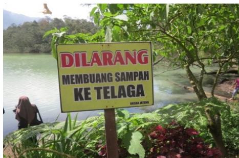
Fig. 10. Warning Sign in Telaga Warna (Doc, 2015)

Based on the results of observation it is very clear that Telaga Warna and Pengilon have some potencies to be developed in term of tourist attraction. The development can include the addition of tourism supporting facilities, such as the road to the lake Telaga Warna, facilities in the Telaga Warna such as places or spots to enjoy the view, camping ground, and adequate office. Toilets should also be provided adequately with good maintenance. Native plants in this area may be offered as a tourist attraction that if it is managed properly. If in this area a botanical park with a typical plant is managed properly, it is something can attract for tourists to visit. In this case, the involvement of local community is very important [8, 12, 13].