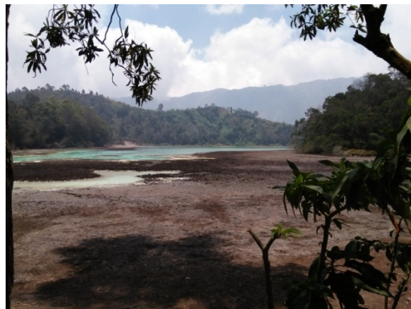
Fig. 11. Sediment to Decrease the Volume of Telaga Warna (Doc. 2015)

to maintain the sustainability of natural attractions of Telaga Warna and Telaga Pengilon.