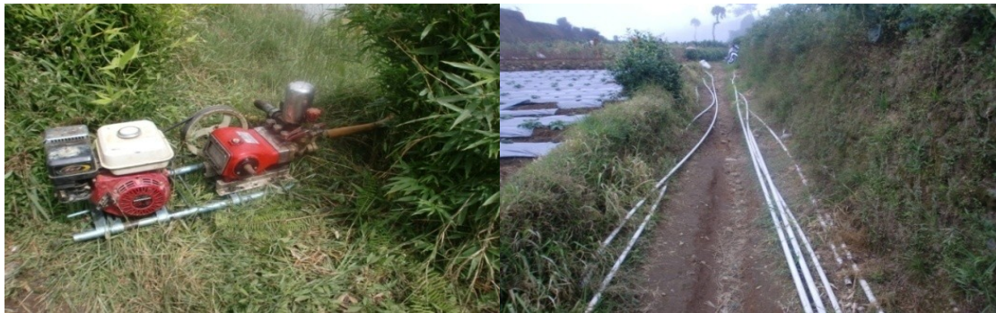
Fig. 6. Irrigation Facilities (water pumps and pipes) ( Doc. 2015 )