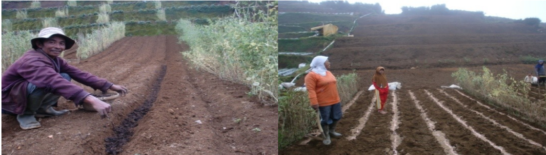
Fig. 5. Preparing Land for Potatoes Plantation ( Doc. 2015 )

community, in the form of opening of business fields and increasing revenue, not only to the local government, but also for the surrounding community.