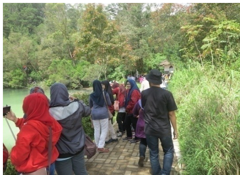
Fig. 8. Tourists activities in the Jogging Track ( Doc. 2015 )