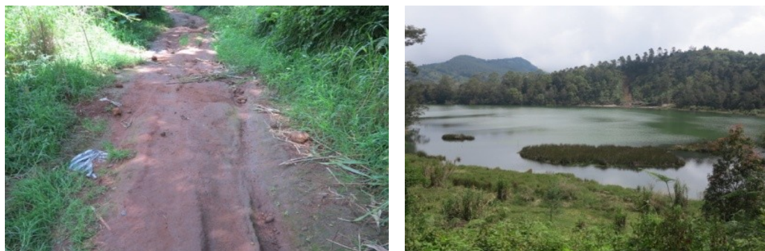
Fig. 9. Jogging Tracks as Sediment Source (left) and Sediments in Telaga Warna (right)

Water quality data from both Telaga appear to be much different, especially from the pH and TSS parameters. The pH at Telaga Warna indicates that the water of the lake is acidic with high TSS, while Telaga Pengilon exhibits a lower of TSS (Table 1 and 2).