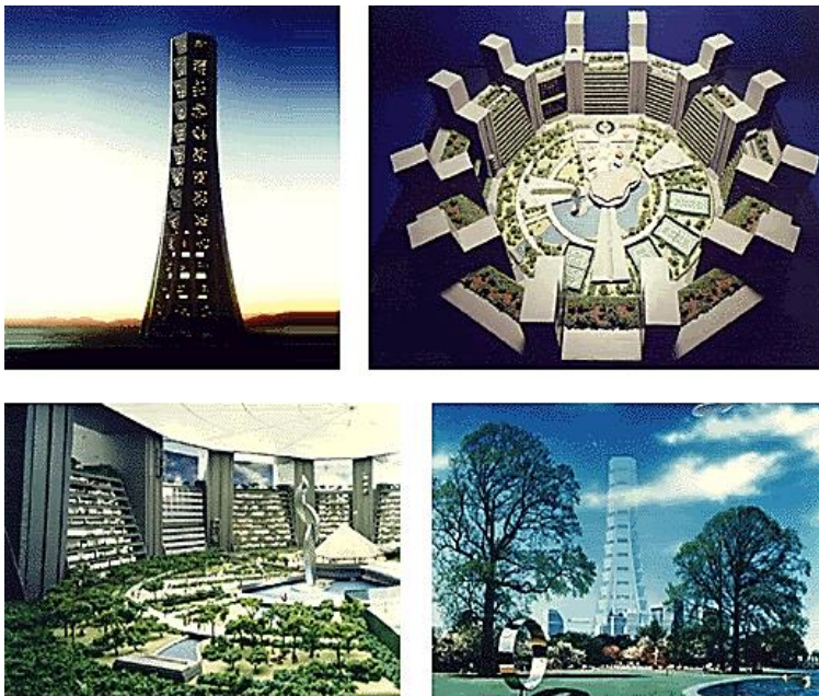
Fig. 4. Project for organizing an autonomous vertical city space in skyscraper. Tokyo, Japan.

A different take on the vertical layout is in the 196-floor skyscraper-city «Tokyo's Sky City 1000» project, developed by Japanese company "Mori". The skyscraper is divided into 14 platform sectors, each the size of a stadium, which can accommodate 35,000 people for living and further 100,000 for working. This city-skyscraper is designed to incorporate full-circle urban infrastructure and to satisfy all human needs including; accommodation, work and recreation. Being a full-fledged city, this skyscraper will help its inhabitants save a great amount of time. This is an especially pertinent factor considering that nowadays, most of Tokyo's citizens spend anywhere from two to four hours commuting [9]. Combining the hours spend commuting each day, in an average lifetime, commuting takes up six years.