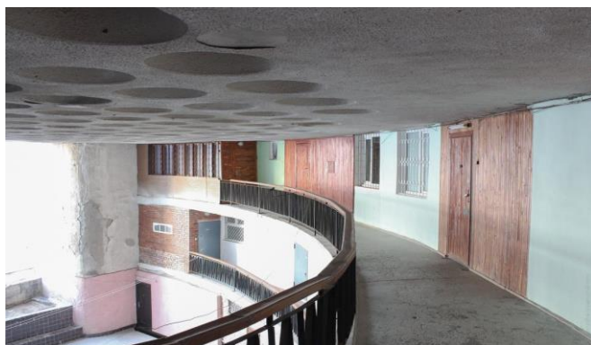
Fig. 2. Organization of public vertical space in the residential house. Tashkent, Uzbekistan.

Another noteworthy example is the experimental 16-story residential building with vertically composed public spaces was built in Tashkent, Uzbekistan. In this monolith construction, two buildings are connected at certain floors (2, 5, 8, 11 and 14) by traditional Uzbek open galleries [5]. Multi-story spaces were aimed to establish public zones for rest and residential interaction (see Fig. 2).