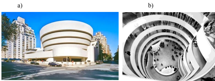
Fig. 1. The organization of vertical environment space in the Guggenheim Museum, New York City, USA.

One of the major techniques used in creating vertically-oriented environmental layouts was the implementation of atriums that ensured the organization of multi-storey internal space with natural lighting and natural ventilation. A primary example of this technique is clearly seen in the construction of the Guggenheim Museum in New York City, USA. Implementation of an atrium into construction, besides creating a distinctive layout and composition (see Fig. 1a), works to organize traffic of visitors inside the space on the ramp, from top to bottom (see Fig. 1b).