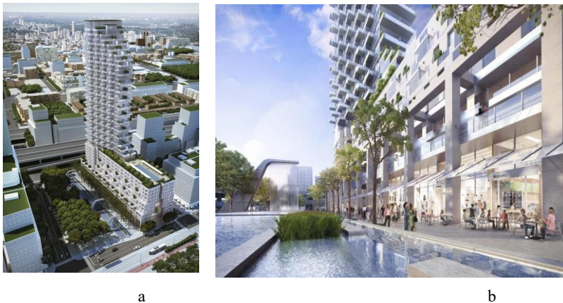
Fig. 2. Monde Condos: a - look outside, b - the collective space of Monde Condos