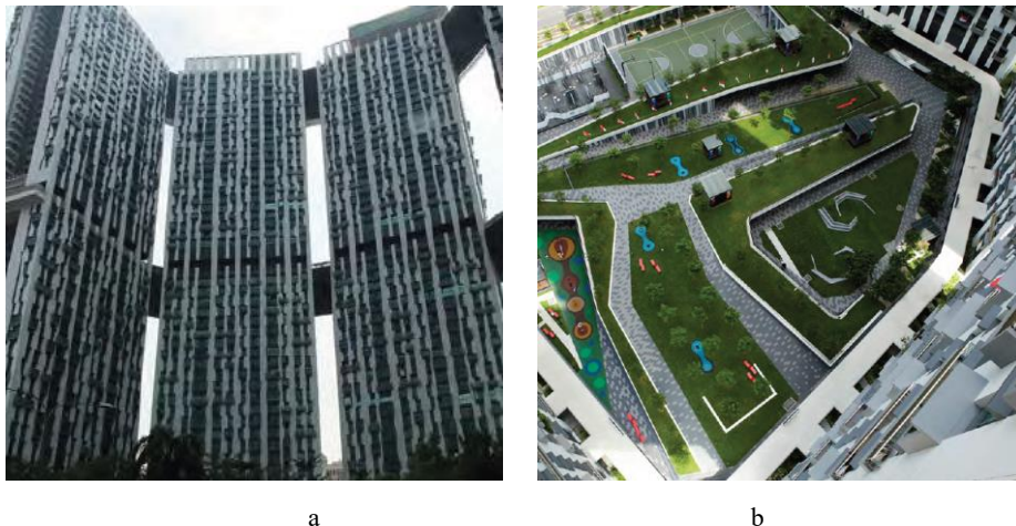
Fig. 1. Pinnacle@Duxton: a - look outside, b - the collective space of platform