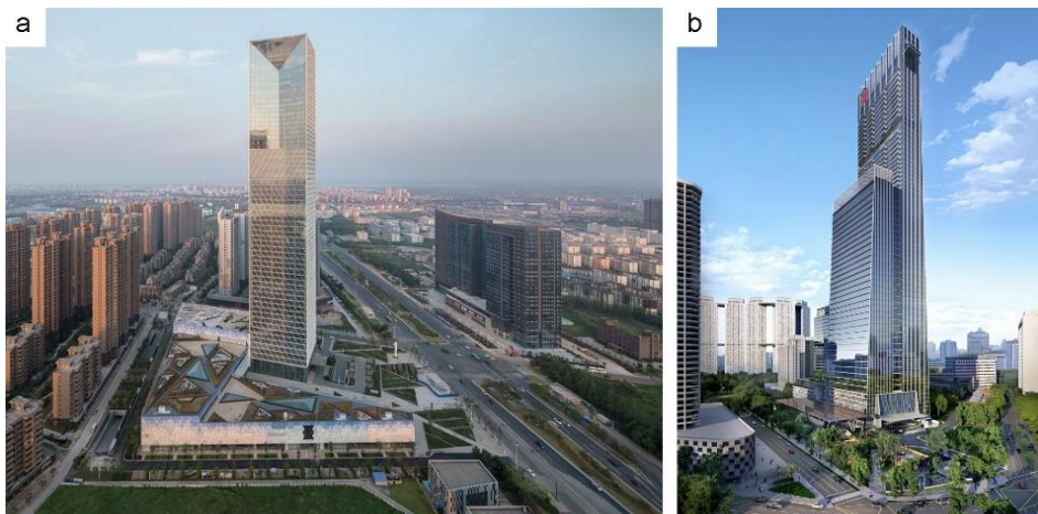
Fig. 3. Mixed-use tall buildings, a - «Jiangxi Nanchang Greenland Zifeng Tower» (268.0 m), Nanchang (China), b - «Tanjong Pagar Centre» (290.0 m), Singapore.

Jiangxi Nanchang Greenland Zifeng Tower in Nanchang, China, a 56-storey (268 meter) building, should be referred to «mixed-use tall buildings with provision of services». Two-thirds of the building is occupied by offices, and the upper, more prestigious floors, are occupied by a luxurious hotel occupies [14]. This building stands on the podium which houses service functions. There are open terraces, rest areas, etc. (see Fig. 3a) on its accessible roof.