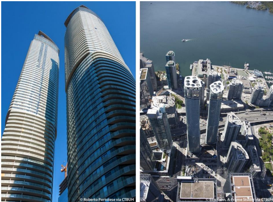
Fig. 4. «ICE Condominiums at York Centre 2» (234.1 m), Toronto (Canada) [ http://skyscrapercenter.com/building/ice-condominiums-at-york-centre-1/11636 ].

«ICE Condominiums at York Centre», consisting of two residential tall buildings located on one podium, can be referred to «a single-function residential tall complex with provision of services». The complex is built in Toronto, Canada (see Fig. 4). The height of residential buildings is 234.1 and 202.3 meters, 67 and 57 floors, respectively. There are medical and sport facilities such as a gym with the latest cardio-training equipment, a swimming pool, leisure and entertainment zones, playgrounds for children, etc. in the structure of the podium [17, 18]. The inclusion of service functions into the structure of the podium creates a comfortable modern living environment for residents of the complex.