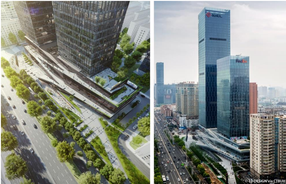
Fig. 2. «Greatwall Tower 1» (240.0 m), Wuhan (China) [ http://skyscrapercenter.com/building/greatwall-tower-1/26388 ].

Jiangxi Nanchang Greenland Zifeng Tower in Nanchang, China, a 56-storey (268 meter) building, should be referred to «mixed-use tall buildings with provision of services». Two-thirds of the building is occupied by offices, and the upper, more prestigious floors, are occupied by a luxurious hotel occupies [14]. This building stands on the podium which houses service functions. There are open terraces, rest areas, etc. (see Fig. 3a) on its accessible roof.