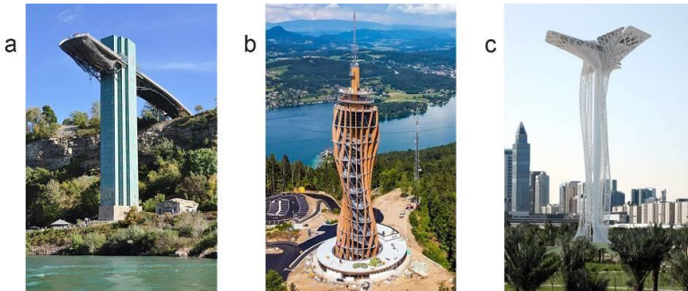
Fig. 4. Examples of the accentual approach to integration of observation towers in the natural / natural-anthropogenic environment : a - USA [36]; b - Austria [37]; c - United Arab Emirates [38]