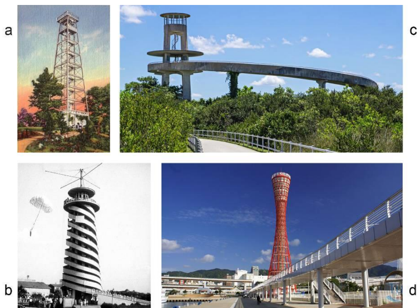
Fig. 1. Examples of tower structures of the 20th century:

a - national park Hot Springs, USA, the photo was taken in 1932 [21], b - Central Park of Culture and Leisure named after Gorky, Moscow, USSR, the photo was taken in 1937 [22]; c - Shark Valley, Miami, United States [23]; d - Kobe, Japan [24]