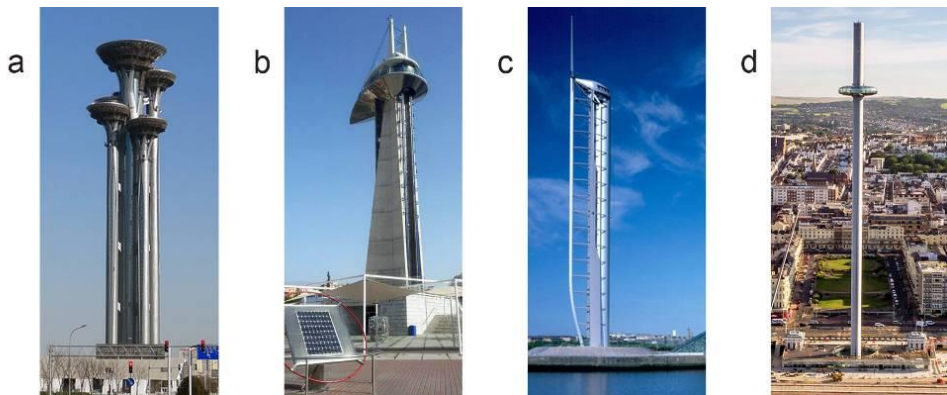
Fig. 2. Examples of observation towers located in the urban environment: a - Beijing, China [29]; b - Madrid, Spain [30]; c - Glasgow, Scotland [31]; d - Brighton, England [32]

Modern observation towers ceased to be the ordinary engineering structures long time ago. Unique technical and architectural solutions allow them to become city or area symbols, identifiers. This is most evidently seen in the tower construction in the urban environment (figure 2).