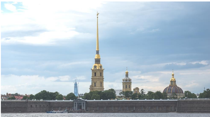
Fig. 3. Lakhta Center Building in the historical panorama of the Peter and Paul Fortress

The location of a new object in the visual area of an ensemble is often observed in historical parts of cities. In Saint Petersburg, cases of architectural and urban-planning violations, related to the introduction of high-rise dominants into the environment of historical river panoramas, are observed [10]. Here, results of the unscientific approach to solving the complex problem of combination of “new” and “old” are much in evidence. A typical example is the appearance of the Lakhta Center building within the historical river panorama of the Peter and Paul Fortress [11]. The building is located at a considerable distance from the historical part of the city, and, due to its height (462 m), it can be viewed from various points of the city center (Figure 3).