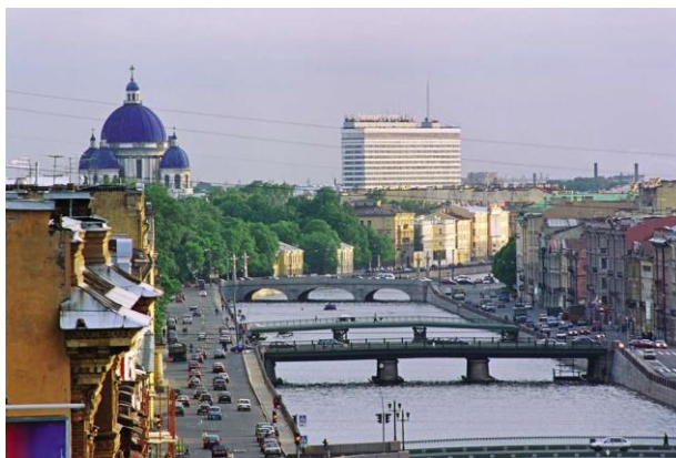
Fig. 2. Sovietskaya hotel in the Fontanka River panorama

Two years earlier in Leningrad, first high-rise facilities, i.e. Sovietskaya and Leningrad hotels, were built by the 50 th anniversary of the Great October Socialist Revolution [2]; with their rectangular forms, they were the first to violate the skyline of the city’s historical part (Figure 2). The construction of these facilities laid the foundation for high-rise construction both in the historical urban nucleus and in close proximity to the historical center.