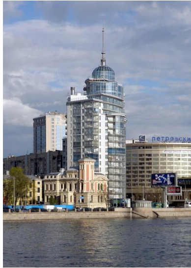
Fig. 6. Aurora residential complex

suppressed by large-scale forms of the high-rise structure located on the opposite bank of the Neva river.