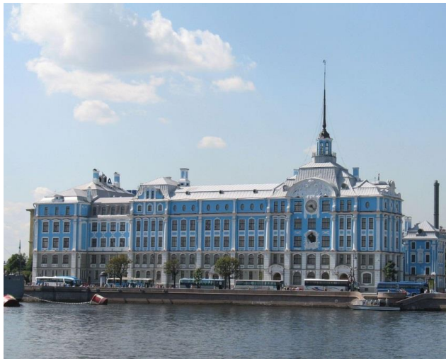
Fig. 7. School House building

Replication of a unique technique in new high-rise construction is presented in the architecture of the Aurora residential house. It is a technique, widespread in the modern practice, allowing to join new and old by repeating some forms of a “historical neighbor” in a new building [13]. However, this technique leads to the opposite result: the architectural significance of the historical object is reduced. The crowning tower of this large high-rise building clearly reminds the cupola-spire top of the School House (Figure 7). This large-scale “look-alike” makes the low historical building to seem even lower and the role of one of the dominants of the Neva panorama is reduced practically to zero [1].