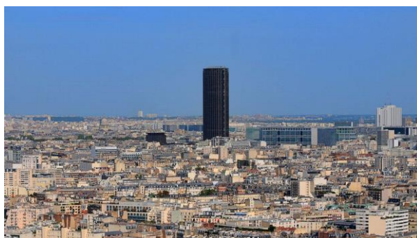
Fig. 1. Montparnasse tower in Paris

Almost all European capitals experienced adverse effects of high-rise construction within visual borders of historical cities. For example, the standard Parisian development, formed by rental houses in the late 19 th century, began to lose its architectural and urban-planning unique character starting from the end of the 1950s in the forefront of keen enthusiasm for modern geometrized architecture “from glass and concrete”. Construction of high-rise buildings also was qualified as a “modernity” feature. For example, in the late 1960s, the competition of projects for the reconstruction of the central market of Les Halles (“The Belly of Paris”) represented, among others, proposals based on the “enrichment” of the historical environment with high-rise dominants [1]. For example, J. Faugeron proposed to locate five towers in the historical center, height of which would reach forty–sixty floors. Thus, the historical development was doomed to serve as a background for new high-rise buildings. The radical project of Faugeron was not approved, but, nevertheless, in 1969, the construction of the 150-meter Montparnasse tower started; it became the first dominant violating the historical architectural landscape (Figure 1).