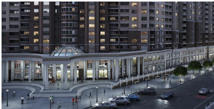
Fig. 1. Approved sketch of the residential complex "Heart of the City".

In fact, completed projects can significantly differ from the approved sketches, what is excluding the possibility of achieving the stylistic unity of new buildings with existing buildings. One of the examples of the discrepancy between the finished project (Fig. 2) and the approved sketch (Fig. 1) is the residential complex "Heart of the City", located at: Voronezh, Kukolkina street, 11.