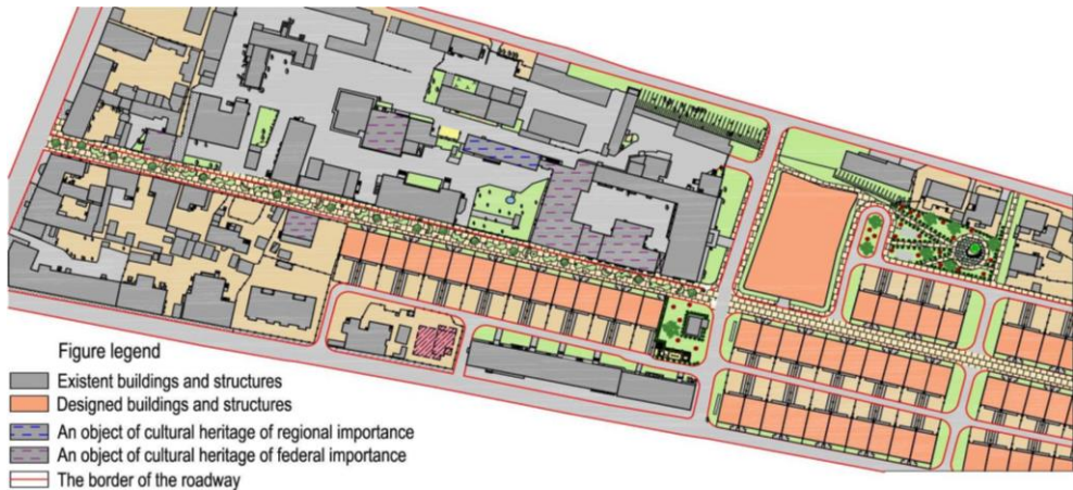
Fig. 7. Project proposal for the scheme of the planning organization of the Vaitsekhovskiy street.

It should also be taken into account that the assignment of the pedestrian zone to the Vaitsekhovskiy street, the restoration of cultural heritage sites, as well as the renewal and increase of the housing stock as part of its reconstruction will lead to the need to improve transport and pedestrian accessibility, namely: the expansion of the pedestrian zone, the creation of tourist and pedestrian routes and ensuring their connection with the main highways, walking and recreational areas of the city.