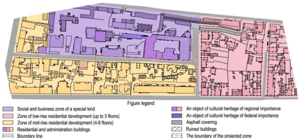
Fig. 3. Scheme of functional zoning of the Vaitsekhovskiy street.

According to Appendix No. 2 to the decision of the Voronezh City Council of December 24, 2014 No. 1694-III "Map of functional zones of the urban district of the city of Voronezh," the section of Vaytsekhovskiy Street limited by Sacco and Vanzetti, Kaliyayev and Tsyurupy streets refers to the zone of construction of three-floored buildings. In this area one- and three-floored stone, wooden residential and administrative buildings are situated (Fig. 3).