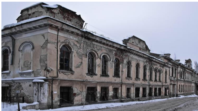
Fig. 4. The current state of the house of Vigel (Tulinov manor).

Vaitsekhovskiy Street is of great historical importance, both for the city of Voronezh and for the entire Voronezh region, and its historical and architectural heritage should be restored and preserved for future generations. In this regard, the first stage of the reconstruction of the territory along Vaytsehovskogo Street suggests the restoration of cultural heritage sites, with the restoration of the bearing capacity of structural elements.