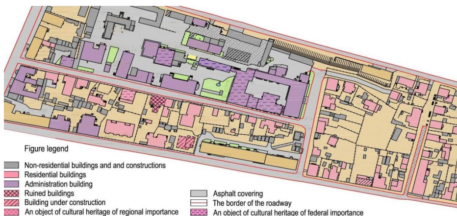
Fig. 5. Scheme of current use of the Vaitsekhovskiy street.

The considered site of historical development is characterized by inefficient use of the urban area in view of the predominance of low-rise individual housing and the use of significant areas for individual garages accommodating (Fig. 5).