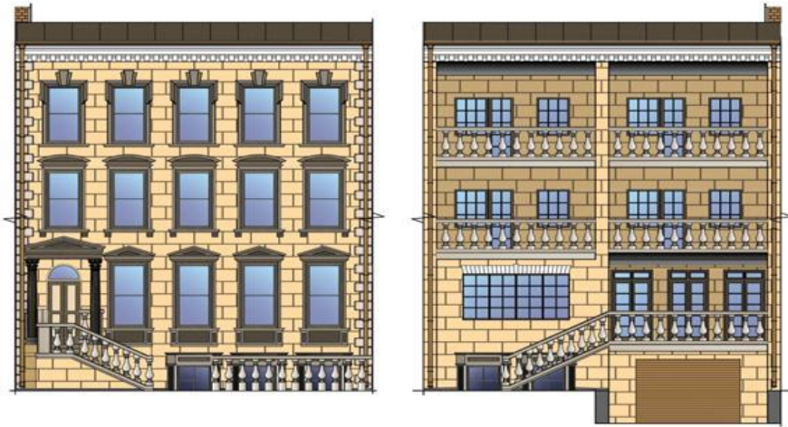
Fig. 6. Street and courtyard facade of the townhouse, developed within the framework of the proposed concept for the reconstruction of the territory along Vaitsekhovskiy Street.

In order to comply with architectural, planning and economic requirements, it is proposed to replace low-rise individual buildings with three-story townhouses [4], taking into account the stylistic features of existing objects of cultural heritage. The variant of the architectural execution of the facades of the townhouse, developed within the framework of the proposed concept for the reconstruction of the territory along Vaitsekhovskiy Street, is shown in the Figure 6. This solution will provide additional living space within the boundaries of the reconstructed territory, equalize the total number of storeys of the building and lead to achieving a stylistic unity of the context area with the preserved architectural monuments.