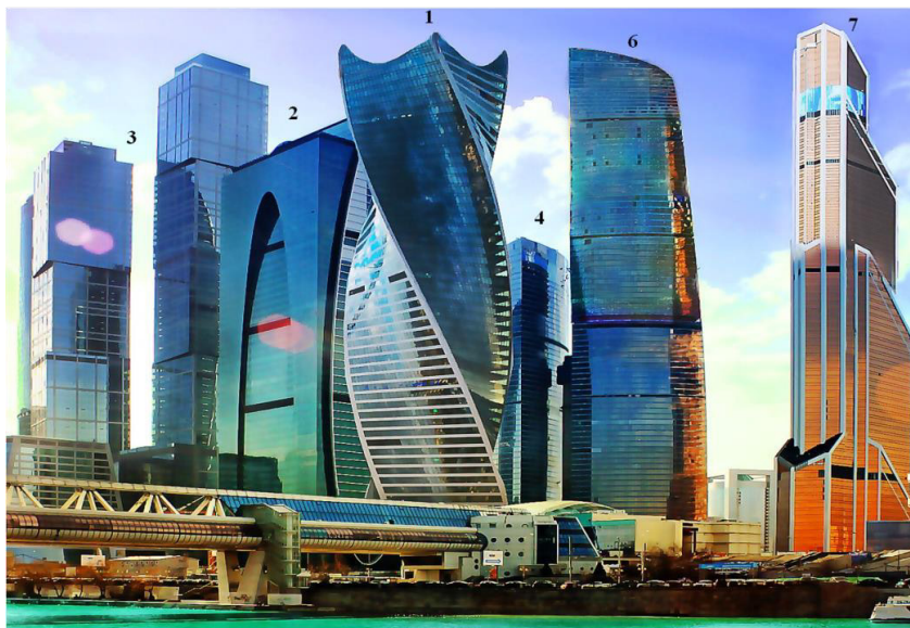
Fig. 1. Moscow International Business Center "Moscow City"

Examples of such facilities are the Moscow International Business Center "Moscow City" and a number of multifunctional high-rise residential complexes. Meantime there are already built such objects as (Figure 1):