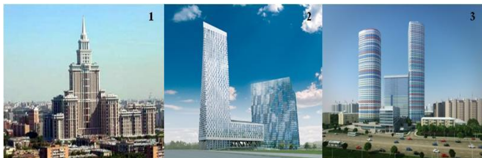
Fig. 1. Moscow multifunctional housing estates

The investment project does not necessarily require capital construction, since investments can be made in the growth of working assets, or the investor can contribute to the project a finished building or existing equipment. Significantly, investment projects, usually, are indivisible and not replicable. It is important to note that investment projects, in a certain sense, are unique. This is manifested in the fact that any project is oriented towards the use of new knowledge about nature, technosphere and society, as well as a certain combination of available resources, that are absent in the market for the purpose to carve out a certain business segment and capitalize on it [2, 3].