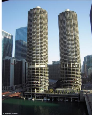
Fig. 1. Marina City

accommodate. Marina City is the axiom of such organization of a complex. The first 19 storeys of the building of Marina City are occupied by the parking having design, unique for the middle of the 60th, twirled on a spiral, which is calculated on 896 parking places. On the 20th storey the laundry, the gym, warehouse, rooms for conferences, theatre, the gym, the swimming pool, an ice skating rink, several shops and restaurants are located. Storeys from 21 to 60 are given for apartments. Under one part of the platform, hanging over the river, the mooring for yachts is located [6] .