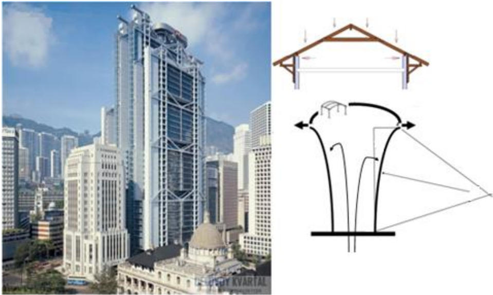
Fig.1 Possible deformation of the vertical walls of the skyscraper due to the impact of uncompensated thrust of the arched roof.

Conclusion 1. On high-rise buildings a significant and dangerous impact has the environment, atmosphere, humidity and ambient pressure. These impacts represent a number of poorly predictable alternating, and randomly alternating loads on skyscrapers. However, the article presents a modern and reliable methods to calculate their impact.