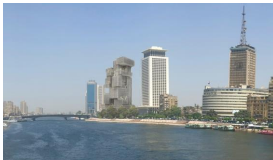
Fig.1. Vertical public high-rise development in Cairo, Prof. M. Eichner, R. Maher 2017

The rapid growth of cities is a global tendency, which can be observed in nearly every cultural and political context today. Not only city centres are undergoing density transformations but potentially every kind of urban territory in medium and large size cities is exposed to economic development pressure to becoming a vertical city with manifold social, economical and technical challenges for inhabitants, the way, how people live together and the ecologic environment. High rise buildings and vertical city districts with groups of tall buildings are in most of the cases designed and built like low rise buildings but with a multiple number of floors, not considering the increased requirement of green spaces for recreation and communication and increased requirements for individual and public transport infrastructure. Successful cities were always open cities with socially orientated building typologies, balanced in functions and architectural styles, with enough open accessible green spaces and every day services.