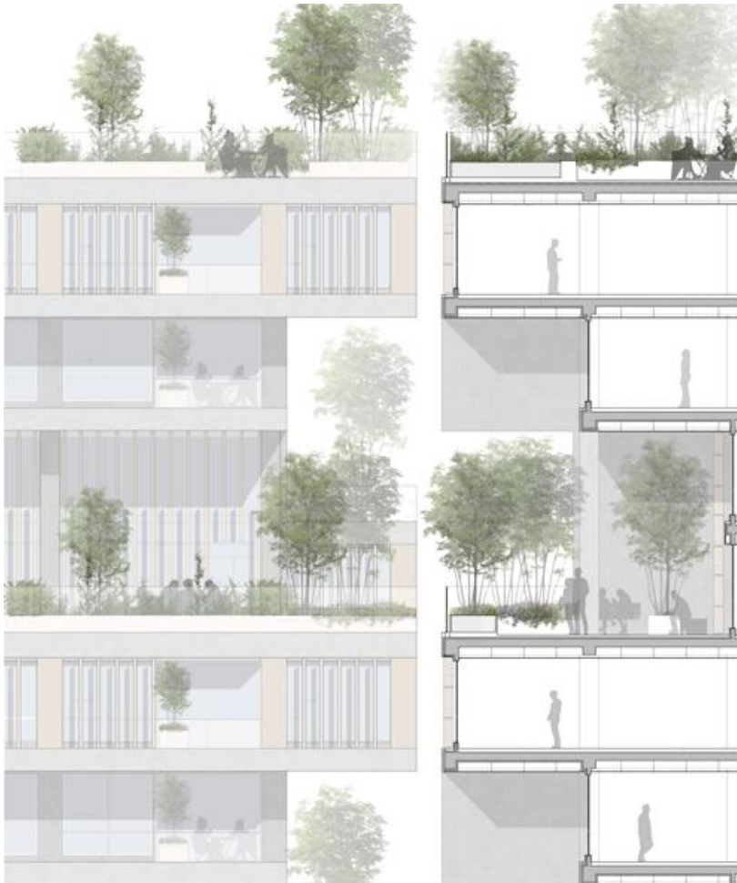
Fig.2. Vertical living city Cairo, detail section, Prof. M. Eichner, R. Anwar, GUC 2017

Providing inhabitants of vertical building structures with a convenient and socially balanced living environment, using minimum energy and other natural resources and at the same time integrating the high rise structure into the urban context, represent the big challenges today. To promote social synergies and a conflict minimized urban atmosphere, facilities like urban district councils, childcare, community stations and public accessible recreation and communication spaces of sufficient areas should be provided. Modern sustainable building standards for housing buildings require from planners and developers to integrate within their development public accessible outside areas for communication, recreation, kids playing and youth activities as barrier-free landscape spaces. A sufficient size is around 10 m 2 per person (synergy effects are allowed, for example the use of fire access roads or similar). In low rise housing districts, public spaces of significant size and high landscape quality are usually integrated in the form of squares, courtyards or pocket parks. Providing in high-rise buildings social valuable open spaces with pleasant and ecologic landscape design for different social groups and generations is widely neglected. One of the authors explored the advantages of an application of sustainable standards in multifunctional high-rise designs for central districts in downtown Cairo.