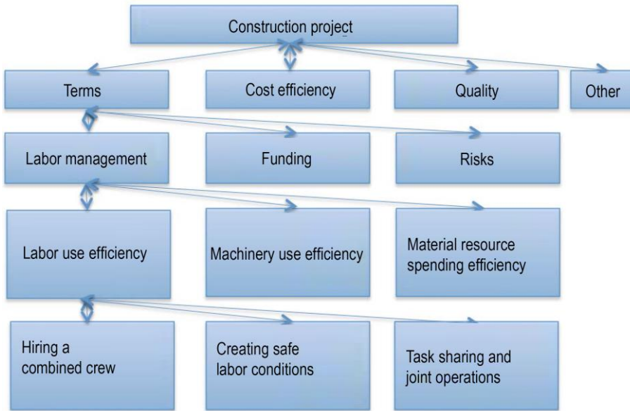
Fig.1. Key factors affecting optimal implementation of a construction project.

Part of that job is to define the notion of integration applied to a construction crew implementing complete cycles of construction and installation works in order to find optimal organizational solutions [3,4].