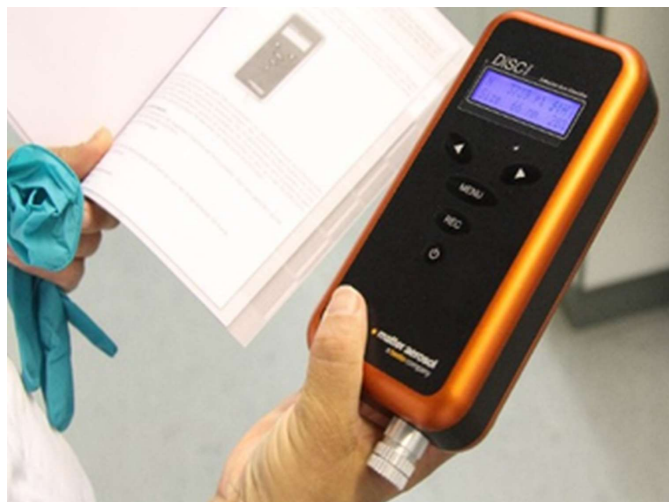
Fig.1. DISCmini handheld diffusion classifier belonging to IPKON RAS EKON Laboratory

According to the applicable methods and procedures, measurements were taken in warm seasons of the year, when the mean temperature in the South Ural region ranges from +10 to +22°C, average wind velocity does not exceed 4 m/s and relative humidity is at most 50%. At all stations, measurements were taken in the periods free from bulk blasting processes in the open pit and underground mine.