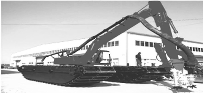
Fig.5. Swampking pontoon excavator with a dredge pump.

be delivered by a road only. Therefore, a pontoon single-bucket excavator with a dredge pump is proposed to be used as a dredger (Fig. 5).