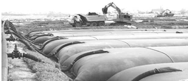
Fig. 6. Geotubes in working condition

The second problem is the sludge pit construction. The conventional technology of the sapropel extraction requires grassy turf to be removed completely on the pit territory. Dike foundations are buried 0.2 m lower than a pit bottom. Dikes are filled with obligatory compaction by bulldozers or excavators. There is no possibility to fill protruding dikes around Lake Khotogor due to the permafrost layer under 0.5 m depth and the upper peat layer of 0.5 m thickness. Therefore, pit walls have to be made of some structural materials, the most available one being larch. In Verkhoyansky district of Yakutia frosts of 40...50 °C settles in November and lasts till May. In some years they can reach more than 60 °C which results in the complete freezing of peat in pits. If special measures are not taken, it is unlikely to thaw during the following summer. Under these circumstances the method of settling peat in pits can be considered impossible, with the method of rotary drum filters BFA of the Astrakhan sapropel center being an acceptable alternative. But this pattern requires powerful energy generating units to drive electric motors. The better method is to use geotubes sewn from woven fabric of geotextile (Fig.6).