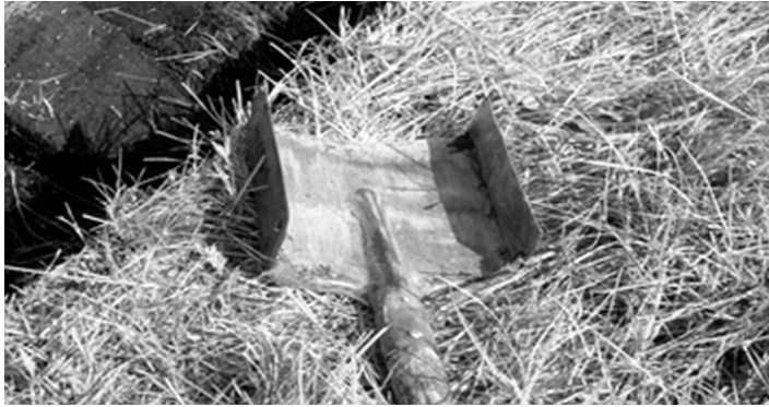
Fig. 2. Spade for cutting peat bricks .

However, rainless spells are quite rare and milled peat, even dried, has high moisture absorption. Therefore, in case of precipitation dried peat must be covered. Peat bricks should be laid in a wave-like way for preliminary drying (Fig. 3).