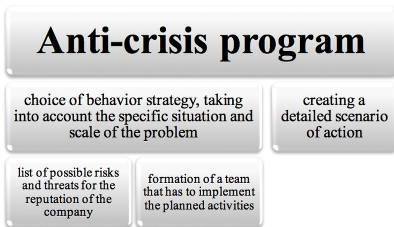
Fig.1. The components of anti-crisis communication program of the enterprises.

The main instrument of anti-crisis public relations is the anti-crisis program, which is a strategic document, or a plan of action in case of crisis situations. The purpose of such a program is not only to overcome, but also to prevent the crisis and restore the lost position of the enterprise. The anti-crisis program should contain the following main components (Fig.1).