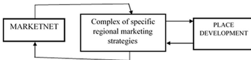
Fig. 2. CHART I Place market net - «MARKETNET» concept.

The term "MARKETNET" was "launched" in the educational process of the universities of Omsk by the authors and received positive assessments.