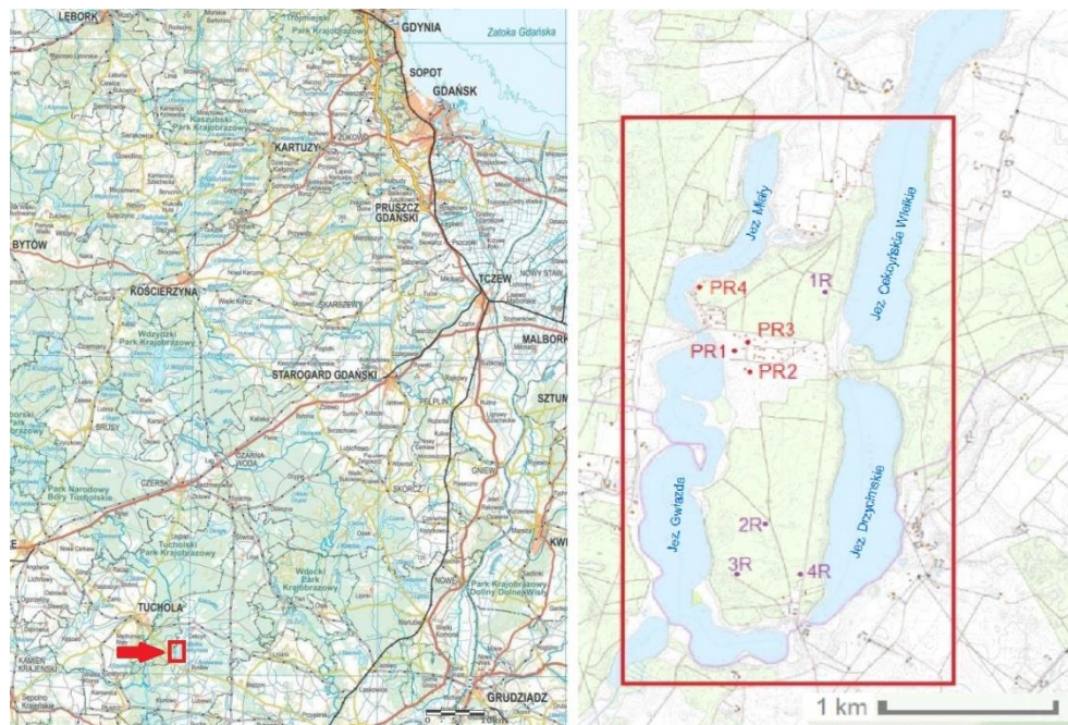
Fig. 1. Map of experimental field (PR – measurement profiles, R – investigation drillings).