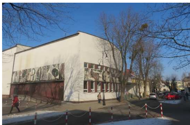
Fig. 3. Successful combination of contemporary architecture with an object from the historical period, view from ul. J. Słowackiego (area no. 1), photo by M. Gosztyła.

Bogusław Szmygin, in his paper titled "Contemporary conservation doctrine - present status and development outlooks" points out that the principles of conservation protection written in traditional doctrinal documents, such as the Venetian Charter, should be elaborated once again. Objectives that were formulated in doctrines more than half a century ago require updating and conservation activity methods should be developed once again. Applying the existing conservation principles to all objects recognized as monuments can lead to an undesirable effect [3].