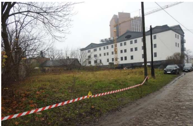
Fig. 5. View towards the southwest on a fragment of neglected buildings and a new hotel from the side of ul. Dominikańska (area no. 2), photo by M. Gosztyła.

The city should be a vivid, developing organism and not a historical open-air museum. The constant development of civilization inevitably enforces changes in the spatial development plan [4]. Therefore, it is necessary to design new objects that follow modern