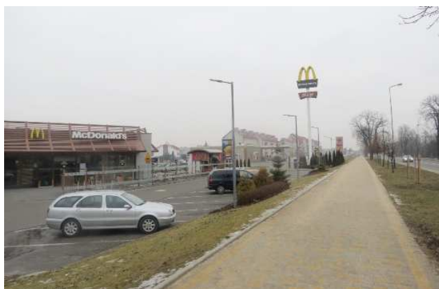
Fig. 6. View towards the northeast on the development of the area between ul. Wł. Sikorskiego and ul. Wiejska (Area no. 3), a fragment of the Dzików housing district, photo by M. Gosztyła.

Buildings with a new architectural expression characterize the area numbered '3' of Tarnobrzeg, and marked on the map. Contemporary residential buildings in this quarter and public utility objects, i.e.: McDonalds, Lotos fuel station, and Primary School No. 9, meet functional standards, but they do not represent environmental values. These objects present the type of architecture commonly found in various places in the country [11]. Entry into the register of monuments does not imply a prohibition on the implementation of modern architecture within an area covered by conservation protection. Taking into account the protection principles in spatial planning and development, pursuant to the Act, provide the public administration bodies with tools for protective measures combined with the revitalization and development of cities. Devastated and disordered landscape of the city should be subject to a process of revitalization bearing in mind the creation of a future landscape [13].