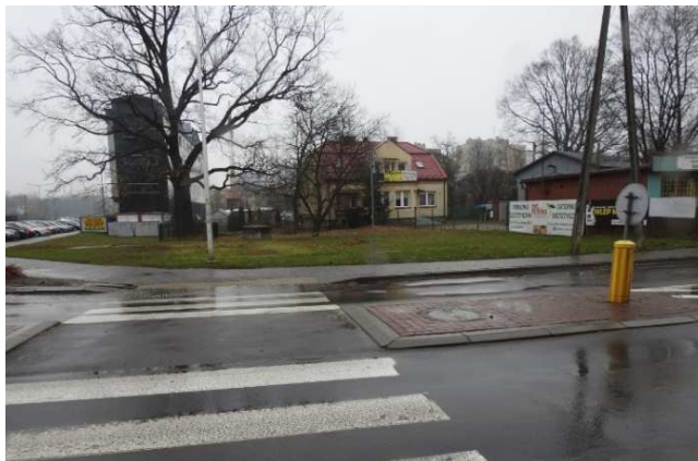
Fig. 4. View towards the north of buildings on ul. kardynała St. Wyszyńskiego and ul. H. Sienkiewicza, noticeable architectural chaos (area no. 2), photo by M. Gosztyła.

There are plenty of examples of buildings from the second half of the 20th century in the centre of Tarnobrzeg, which represent the so-called architecture of pastiche. The visage of the city can be changed by a modern architecture designed in its vicinity. The exclusion of area number '2' from the protection zone and using this area for the purpose of modern spatial design will result in an emergence of a strong accent for a centre that is being developed. These arguments provide the basis for the exclusion of this area from conservation protection [10].