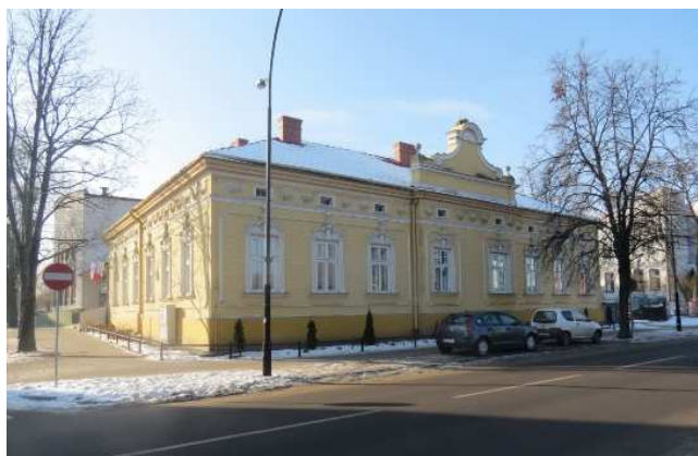
Fig. 2. Facade of an object from the historicism era at ul. Sokoła (area no. 1), photo by M. Gosztyła.