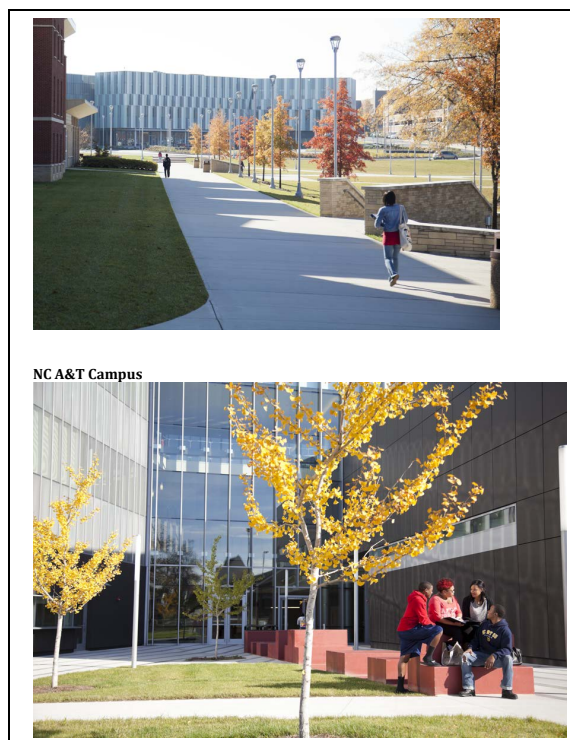
Fig. 1. N.C. A&T Campus

creative use of virtual and physical space. (Fig. 1) shows students enjoying the campus setting of N.C.A&T.