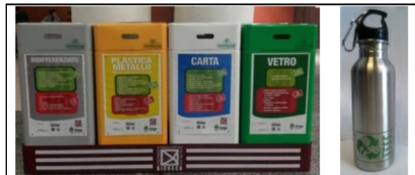
Fig.3. Left: an "Island" for differentiated waste collection at the University of Milano-Bicocca; Right: a BASE water flask

To comply with municipal standards, the containers on the islands were colored differently depending on the type of waste they were to contain (yellow for plastic and metal, white for paper, green for glass, and grey for undifferentiated waste, see Fig. 3), and these proved easy to identify and use. A preliminary communication campaign, giving clear information about the purpose of the new waste disposal system and how to use it, also contributed to the success of this initiative.