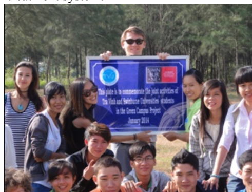
Fig. 1. The students from Tra Vinh University and Swinburn University of Technology

First of all, the green project for sustainable development in order to raise awareness of green ideas among students and staff. It was started by a project co-organized with a university in Australia, Swinburn University of Technology. The students from the two universities have been involved into variety of green activities under the framework of the project. Also, four proposals on green campus were developed by the students with very good ideas including creating waste water treatment system.