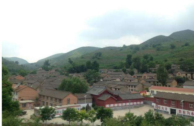
Fig.3. Village Panorama

Historically, Zheshui Village is rich in various folk cultures. With the Shangdangbangzi, Striking iron-clad, and Paolv, the old Shangdangbangzi Theater Troupe often performed in Huguan, Liuquan, Pingcheng, and Lingchuan counties. It was a magnificent scene with striking iron-clad performances. Paolv usually follow impromptu performances following the Yangge team and have become a lively, technologically rich and unique folk performing art.