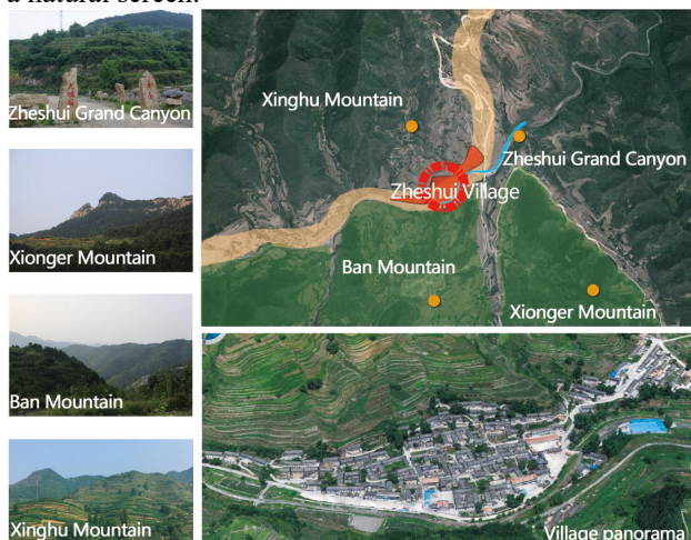
Fig. 1. Geographic Location

Zheshui is located in Liuquan Township, Jincheng City. Located at the turn of the two provinces of Shanxi and Henan and the three counties of Lingchuan Huguang Linzhou. It is surrounded by mountains and rivers. Zheshui River flows through the front, there are Xionger Mountain and Ban Mountain in the south, and Xinghu Mountain and Zhutou Mountain the north. The ancient trees on the hills are very lush, and the tree shading like a natural screen.