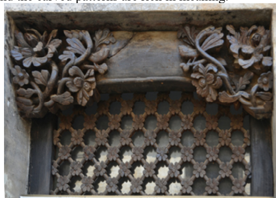
Fig. 2. Wood Carving Decoration

The decoration art in the residential buildings of Zheshui Village is mainly reflected in the carvings and gates. The carving art of Zheshui Village is mainly wood carving, stone carving and brick carving. Wood carvings are generally used for bucket arch, sparrow brace, window frame and other parts. The subject matter is varied. Although the area occupied is small, the most sculpted patterns are fine. Most of the stone carvings are found in drum-shaped bearing stone, column bases, and balustrade. Brick carvings are commonly used in gable wall head, ridge, animal, and screen wall. The overall feeling of brick stone carving is vigorous and powerful, and the carved patterns are rich in meaning.