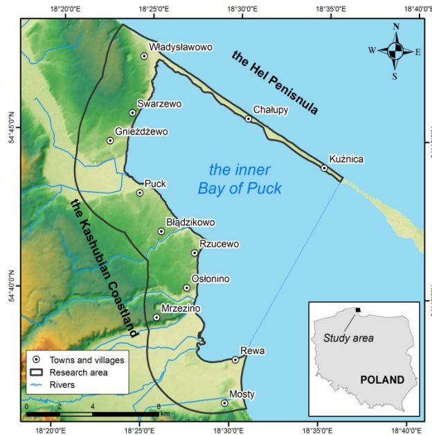
Figure 1. Research area.

which characteristic features are moderate winters and mild summers. The annual temperature is around 7.4°C and the average amount of precipitation does not exceed 700 mm. The income of local inhabitants comes mainly from agriculture, fishery and tourism, related to the seaside location and unique environmental values of this region.