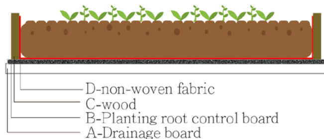
Figure 4. Common mold materials

Taiwan. Recently, the reduction of green facilities costs created opportunities for private sectors to participate the act due to setting materials innovation. The setting of green facilities materials of urban agriculture are composed of drainage board, planting root control board, wood, and non-woven fabric shown in Figure 4.