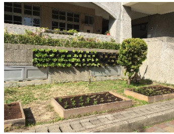
Figure 6. Four-plows elementary school demonstration