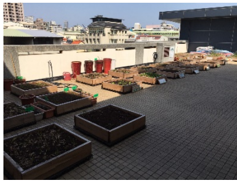
Figure 5. Huilai elementary school demonstration