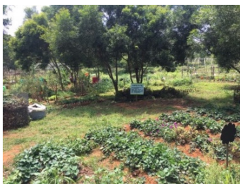
Figure 1. flat agriculture

multiple functions. Building plants on the roof also provides many ecological and economic benefits. [4] Green roofs have a layer of living plants on top of the structure and the waterproofing elements. Green roofs can be installed on a wide range of buildings, from industrial facilities to private residences. Figure 1 to 3 presented the typical types of urban agriculture in Taiwan.