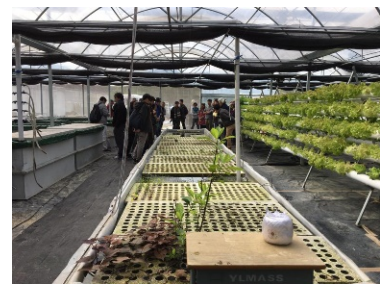
Figure 3. vertical agriculture

Most public sector building roof has green facilities. However, the popularization rate of urban agriculture in Taiwan is still not significantly improved. The main reason is that the public cannot apply the concept of economic added value on green facilities of urban agriculture lead to ineffective result for private sectors in