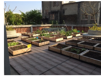
Figure 7. Quiaoxiao elementary school demonstration