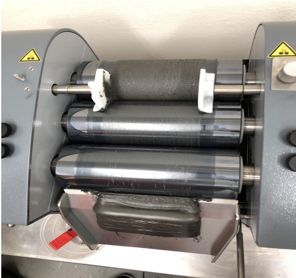
Fig. 3. Phase separation of the existing filler on the three roll mill.

existing filler in the resin are too big to go through the designated gap of the three roll mill. The milled down sample has the highest compressive strength but the lowest tensile strength. The existing steel filler in the resin are suspected to act as the main tensile strength contributor in the unmodified matrix of the epoxy grout. Hence, with the steel filler which is the tensile strength contributor in the matrix separated from the resin in the milled down sample, the tensile strength drops dramatically from the control sample to the milled down sample. On the other hand, with the tensile strength contributor separated, the compressive strength of the matrix can be improved because the matrix will be denser and without any filler.