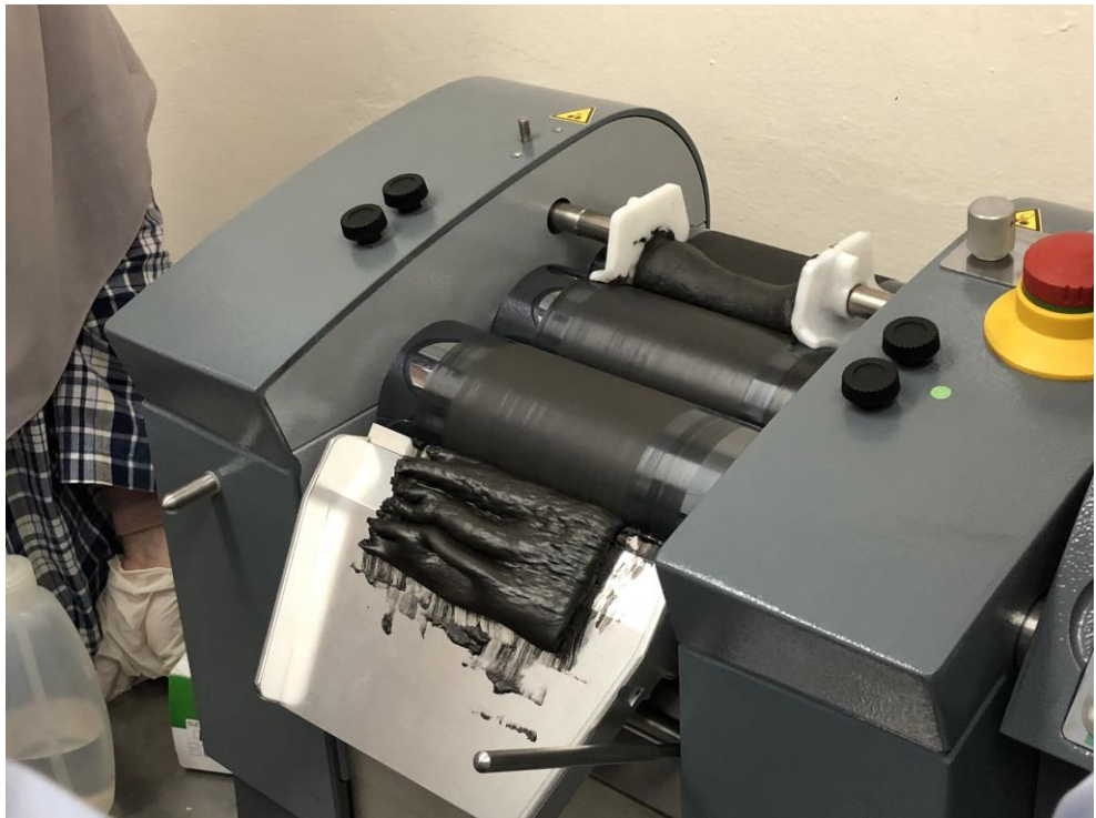
Fig. 2. Calendaring process of CNT-resin mixture.