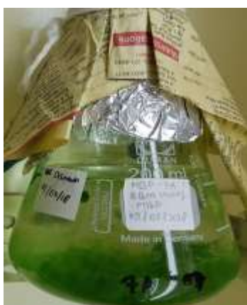
Fig. 1. Biomass Leptolyngbya NBP-7A in erlenmayer flask 200 mL.

The study of growth Leptolyngbya NBP-7A taken 14 days with 9 times of sampling. The result produced growth curve of Leptolyngbya NBP-7A in variant growth media. The growth curve of this study still imperfect, because Leptolyngbya NBP-7A was still adapted with the condition of variation growth media. It could be seen at the growth curve of Leptolyngbya NBP-7A produce the growth curve unstable. The age of inoculum that used in this study was 1 months old.