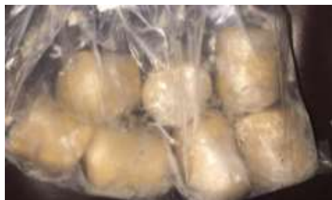
Fig. 4. The typical result of restructuring based on vegetable protein sample

The restructuring based on the vegetable protein with using soy source, after the transglutaminase enzyme addition and then incubated in the 24 h to proceed the crosslinking reaction, the typical result of the sample is shown in Figure 4.