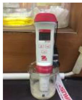
Fig. 2. Acidity Level Test with pH meter

Before the sample is tested, the sample is dissolved first with aquades and homogenized using a magnetic stirrer. Solid sample weight 3.5 grams dissolved with 15 ml of aquades.