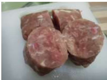
Fig. 3. The typical result of meat restructuring based on animal protein sample

Washing can affect the degree of acidity of meat duck. The washing stage is done for removing the natural components of duck, such as water-soluble proteins, blood and other components, which can affect the decay processes (lipid oxidation and microorganisms) during the storage process at low temperatures [15]. After being incubated and given time to react in a period of time, here is a description of the sample change on samples, as shown on Figure 3.