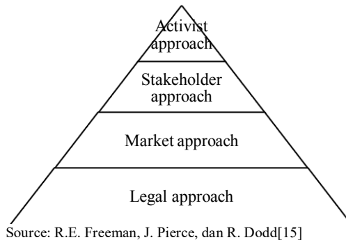
Fig. 2. Pyramid describes the business ethic building

commitments of companies using this approach can be seen with various stages of the depth of activity done. The following is the green nuance approach in four stages.