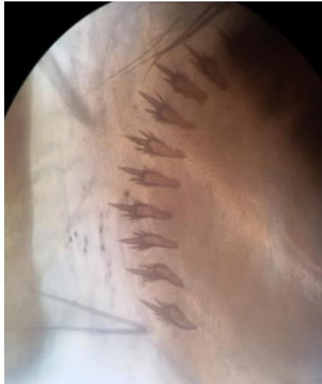
Fig. 2. Comb Scale of Aedes aegypti larvae (magnification 40x10)