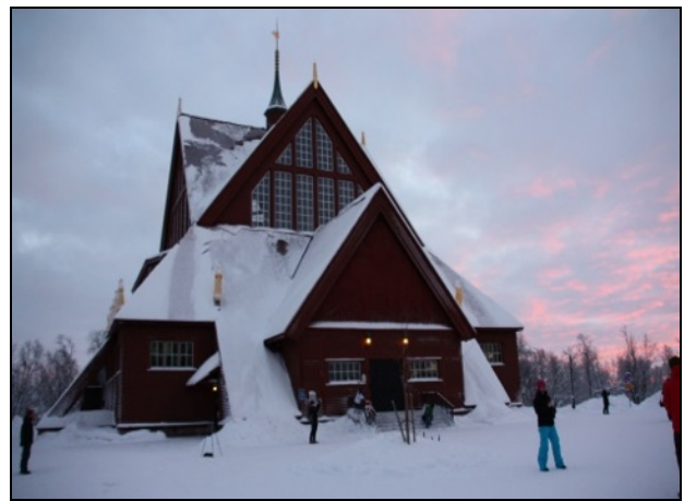
Fig. 2. An antique Evangelical Lutheran church (1909 – 1912) intended to be moved.