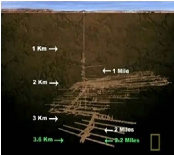
Fig. 4. The Mponeng Gold Mine in South Africa is the deepest gold mine on Earth, Discovery Communications.

The most interesting solution as a crucial for the Polish copper mining could be the air conditioning system. In the Mponeng mine, the original temperature of rocks in the faces reaches 60 °C. To counter that, the air conditioning system uses crushed ice mixed with salt to transfer cold. The stations daily power is 6000 tons of ice. After being brought to underground, the cooling medium is located at the nodal points – constituting source of cold for “weather stations”. The stream of air is controlled and distributed by the network of “weather stations” to the specified workplaces. It allows maintain the temperature of air on the acceptable level – less than 30 °C.