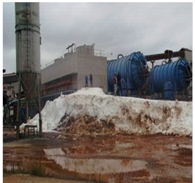
Fig. 3. The shaft site of the Mponeng mine.