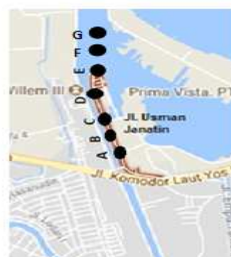
Figure 1. Location Research Detailed (Usman Janatin, Semarang)

This research will be conducted in 2017 with the location of sampling and water quality measurement conducted at Usman Janatin Street, Semarang. The sample analysis will be conducted at the Diponegoro University Integrated Laboratory.