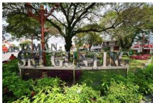
Fig 5. Present Srigunting

mixed several mentioned items into one item due to complicated conditions on the site.