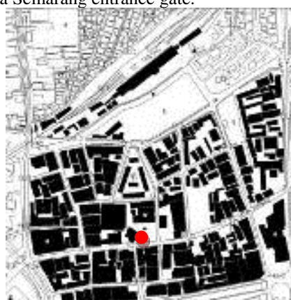
Fig 1. Kotalama Map

This center of Kotalama Semarang district was named Parade Plein. The name itself represent the function in the colonial era (17 th century) as military parade space. The location of military barack near parade plein emphasized the origin of the openspace. In the next period the parade plain was surrounded by many colonial buildings as the VOC area and government walled city. The parade plein turned into more diverse community oriented space with the installment of Blenduk church, entertainment building Oudetrap, Marba warehouse, Justice court, etc. The activities and function become more vary with many type of people and the openspace shape-area automaticly changed to respon it. The location of Srigunting park is in the middle of the kota lama area as a red dot which can be seen in the figure 1. In addition, the location of Srigunting in the past was not in the side of main road compared to present condition. The Jl.Letjend Suprpto street was being main road in early 19 th century as result of reduplication jembatan Berok which become the Kotalama Semarang entrance gate.