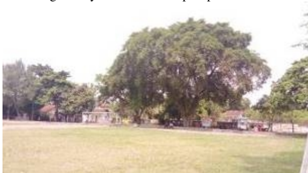
Fig 4. Taman Karang in early 20th century

Refer to the two openspaces case, the internal factor of openspace vacant condition meet the present demand of the citizen near the space brought a new activities and function to the openspace [11]. The citizens might not consider the status of conservation area to define the functions. However the alteration of function gradually transform the openspace amenities.