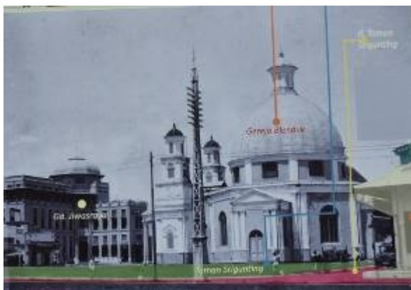
Fig 3. Srigunting in early 19th century

The condition of Kotagede openspace in Taman Karang in early 19th century showed another transformation story from place for nyadran supports into sport facilities (see figure 4). The dwellers made a circular street between cemetery to the taman and house. The street brought park isolation from the surrounding buildings. That condition made Taman Karang as single area with new function. During that period, sport facilities were highly demanded by Kotagede citizen. The size of Taman Karang able to provide soccer facilitation with spectator area around it.