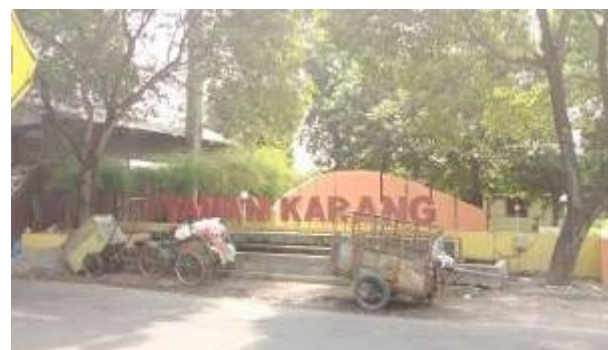
Fig 6 Present Taman Karang

The Taman Karang case slightly different from the Srigunting. The Lansdcape re-shaped, stage formed, architecture detail installment, relaxation zone provided, and surprisely partial restaurant or food stall were established in Taman Karang [13]. The shape of park, soccer field stage rounded by pedestrian way and tribune made the Taman Karang become ideal place to relax and do culinary tourisme. The restaurant/food stalls only provide their food stall or gerobak and klasa or traditional carpets on the relaxation area to set their activities under the trees or food stall roofs and they generate others supports such : transportation and garbage disposal service .