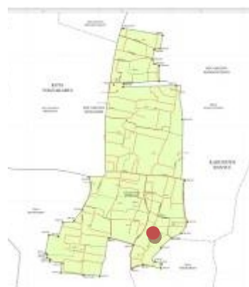
Fig 2. Kotagede Map

of the cemetery. The activities in Taman Karang were supporting the nyadran tradition and meeting place. In further development, the sport facilities such : soccer goal and lines, tribune and circular pavements. The location of Taman Karang is not in the middle of the area like Taman Srigunting to the Kotalama but in the far side of Kotagede center as red dot in figure 2. The location of taman Karang was highly related to it original function as transition space to urban cemetery Kitren. Refer to the term of open public space can be determined as park, streetscape, atrium, plaza, waiting room, and indoor or outdoor public space. The origin functions of Taman Karang are compilation of park, streetscape, atrium/plaza for waiting in outdoor area to enclosed cemetery.