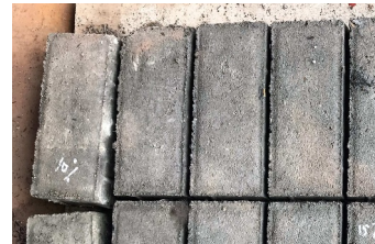
Figure 1. Paving Block with paint sludge variation