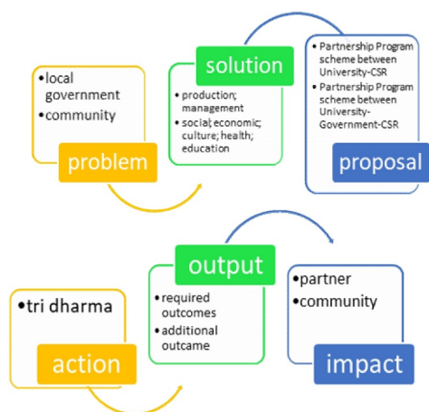
Figure 2. Scheme Process of Proposal Preparation and Implementation

The real form of mentoring can be seen from the efforts of Universitas Diponegoro who perform one of Tri Dharma of Universities is the empowerment of the village society in Semarang City. This empowerment program is carried out in a sustainable manner, in accordance with the respective source of funding. As funding source of the program can be derived from Ministry of Research, Technology and Higher Education; internal funds of the university; and cooperation funds with industry, or government/private institutions. Opportunity for collaboration between University-Industry-Government can be seen from the existence of Partnership Program scheme between University-CSR or University- Government-CSR [12]. This scheme emphasizes the synergy that is built in the University-Industry-Government relationship manifested in the form of cooperation of expertise, integration, togetherness in the implementation of the program and the funding contribution (Fig. 2).