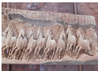
Figure 7. Relief of 8 Horses Running, by Ali Rifa'i