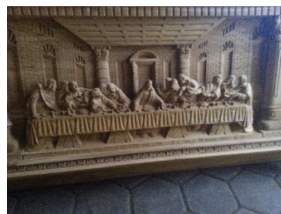
Figure 1. Relief of the Christian "The Last Supper" by Mulyoharjo Village Craftsmen.

In addition to religious themes, there are also reliefs with the theme of community life. Each relief has a philosophical meaning which describes a story. One of the life-themed reliefs illustrates the village atmosphere that is shady with the activities of farmers and cattle cart