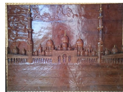
Figure 4. Carving Relief with Mosque Themes

drivers. In addition, there are reliefs that have philosophical meanings including the relief of 8 horses. Relief of 8 horses has a meaning of great career, tenacity and courage, as well as the speed of action to achieve