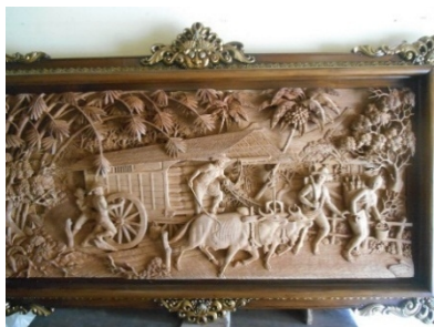
Figure 5. Cattle and Farmer Relief one of Soekarno's Works

progress. There is also 9 koi relief which has a meaning of hope for prosperity and luck