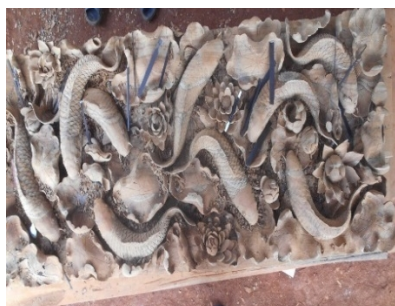
Figure 6. 9 Koi Fishes Carving by Ali Rifa'i