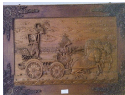
Figure 3. Carving Relief with Wayang Story as part of Jepara Carving Museum Collection