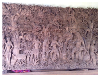
Figure 2. Carving Relief with the Story of Ramayana Hunting