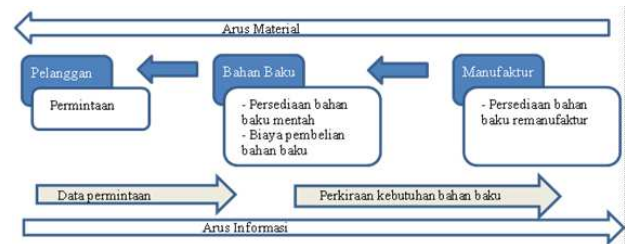
Fig. 2. Supply chain inventory model

cost of DE supplies. Supply chain inventory model illustrated in Figure 2.