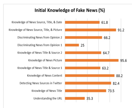
Fig. 3. Initial Knowledge of Fake News ( % )

The programmed duration of the campaign is 3 months and held in 5 public and private high schools in Semarang. As a pilot event, SMA 9 Banyumanik was appointed to be the place of the first campaign with 68 students as participants of half day workshop. Prior to the workshop, a pretest was conducted on the initial knowledge of fake news and its features. The fact that fake news or hoax is a popular issue is reflected in the knowledge of all workshop participants who understand well the fake news or the hoax. But it is unlike when it comes to how to detect and the ability to spot fake news. Can be shown in Figure 3.