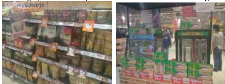
Fig. 2. SME products in X supermarket.

The type of superior product of the Sidoarjo Town which is marketed at X Supermarket is a food and beverage product. SME products marketed can be seen in Figure 2.