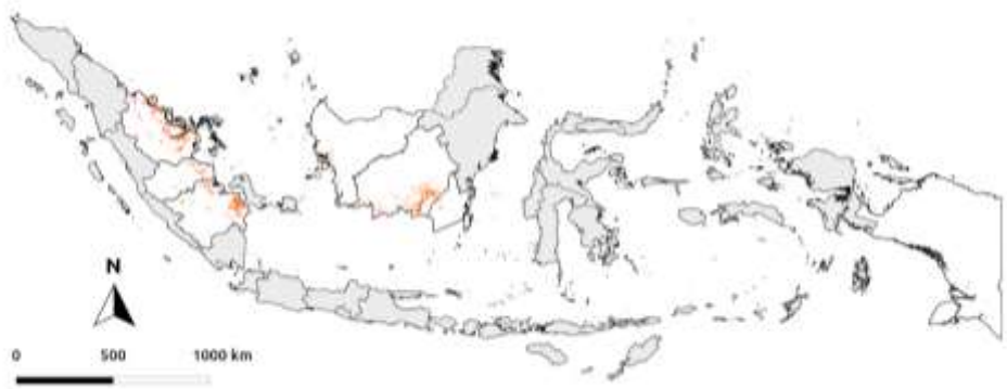
Fig. 1. Map of targeted restoration area by Badan Restorasi Gambut, Indonesia.

According to the geographic data of peatland which has been published by The Center of Agroforestry Resource, Ministry of Agriculture -- Balai Besar Sumber Daya Lahan Pertanian (BBSDLP); Indonesia has 12,932,489 hectare peatlands which has divided as the conservation and cultivation areas. The BRG 2016 report mentioned that there are 875,000 hectare peatlands was burned during fire in 2015 [6], although the National Disaster Management Agency -- Badan Nasional Penanggulangan Bencana (BNPB)-- stated that it was 618,574 hectares. Nevertheless, all of those burned peatland are on the targeted restoration area and classified as the most prioritized sector. The data that BRG was collected proved depicted that more than 50% of the restoration objective area is in the concession area of the private company [7]. It is only one million hectares remain as non-concession that be the BRG main focus area for restoration project.