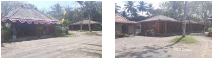
Fig. 2. Hotel accomodation of Borobudur VEC.

The other business provided by the Borobudur’s VEC is the lodging service, hotel. This hotel has 7 single rooms, 4 couple rooms, and 12 family rooms. Each room is equipped with AC, TV, water heater, wardrobe, dressing table, table lamp, tea set and chairs.