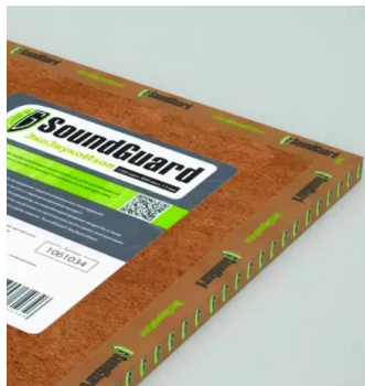
Fig. 4. EcoZvukoIzol.

The EcoZvukoIzol panel is a Russian soundproof construction. The panels provide a multiple decrease in impact and sound energy of the wave over the entire frequency range (Fig. 4). This result is achieved due to the massiveness (multilayers). The panel is a solid seven-layer cardboard profile filled with heat treated mineral quartz filler of specially selected granulation [15, 29].