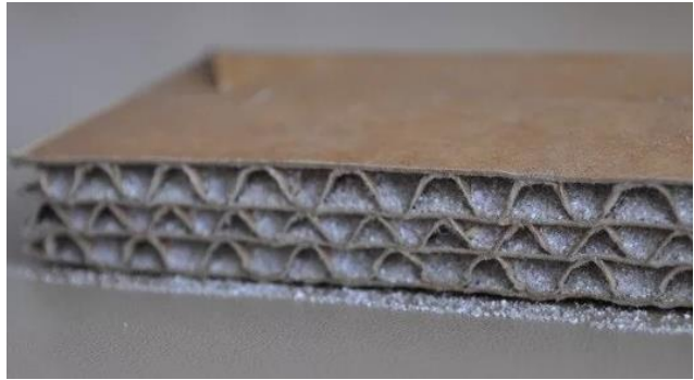
Fig. 3. PhoneStar-Triplex.

The EcoZvukoIzol panel is a Russian soundproof construction. The panels provide a multiple decrease in impact and sound energy of the wave over the entire frequency range (Fig. 4). This result is achieved due to the massiveness (multilayers). The panel is a solid seven-layer cardboard profile filled with heat treated mineral quartz filler of specially selected granulation [15, 29].