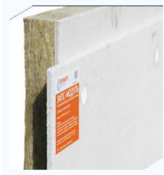
Fig. 2. ZIPS-Module.