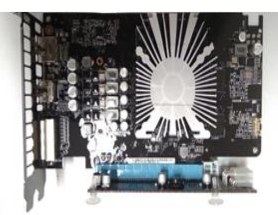
Fig. 4. Immersion GPU

Figures 3 and 4 shows that there is no visual difference between the configuration of fan and immersion cooling method six months after the GPU has been immersed in a mineral fluid.