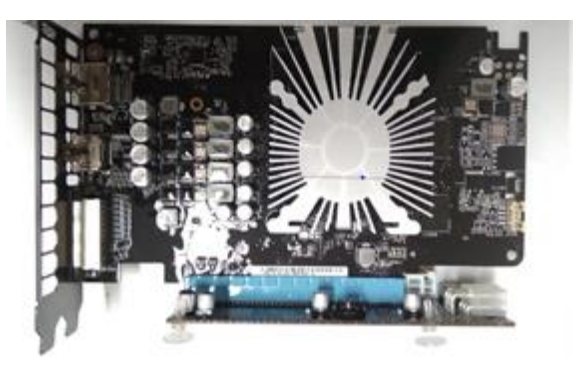
Fig. 3. Fan GPU