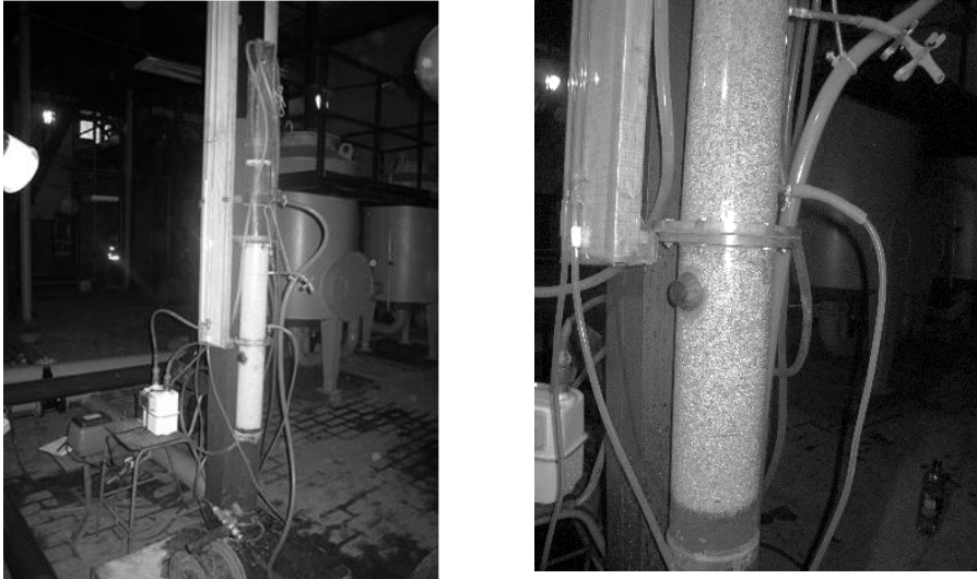
Fig. 1. General view and fragments of the pilot plant.

A pilot plant was installed in the filtering chamber of the treatment facility (Fig. 1) to investigate impulsive flushing of the floating filter media. It included pilot filter with polystyrene floating media, equipped with pipes, shutoff and control valves, and samplers. Pipe fitting allowed carrying out upward (FPZ-1) and downward (FPZ-4) filtration. Characteristics of floating media are given in Table 2.