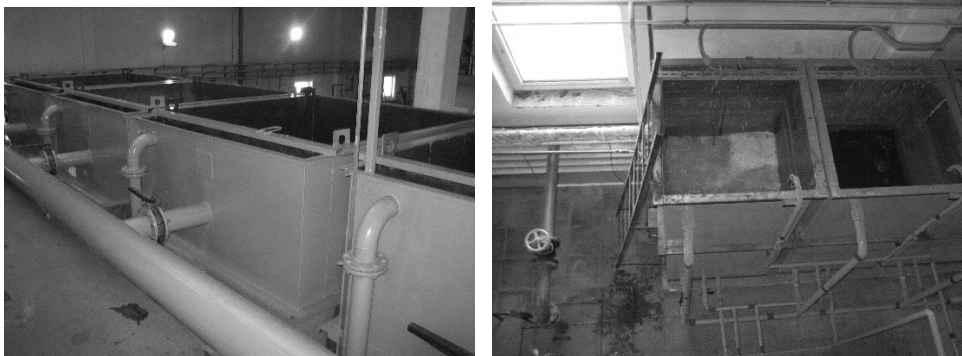
Fig. 4. Industrial filters FPZ-1 (Moscow).

The results of conducted research have been introduced into industrial treatment facility with a capacity of 4000\text{ m}^3/\text{day} , its general view is shown in Fig. 4.